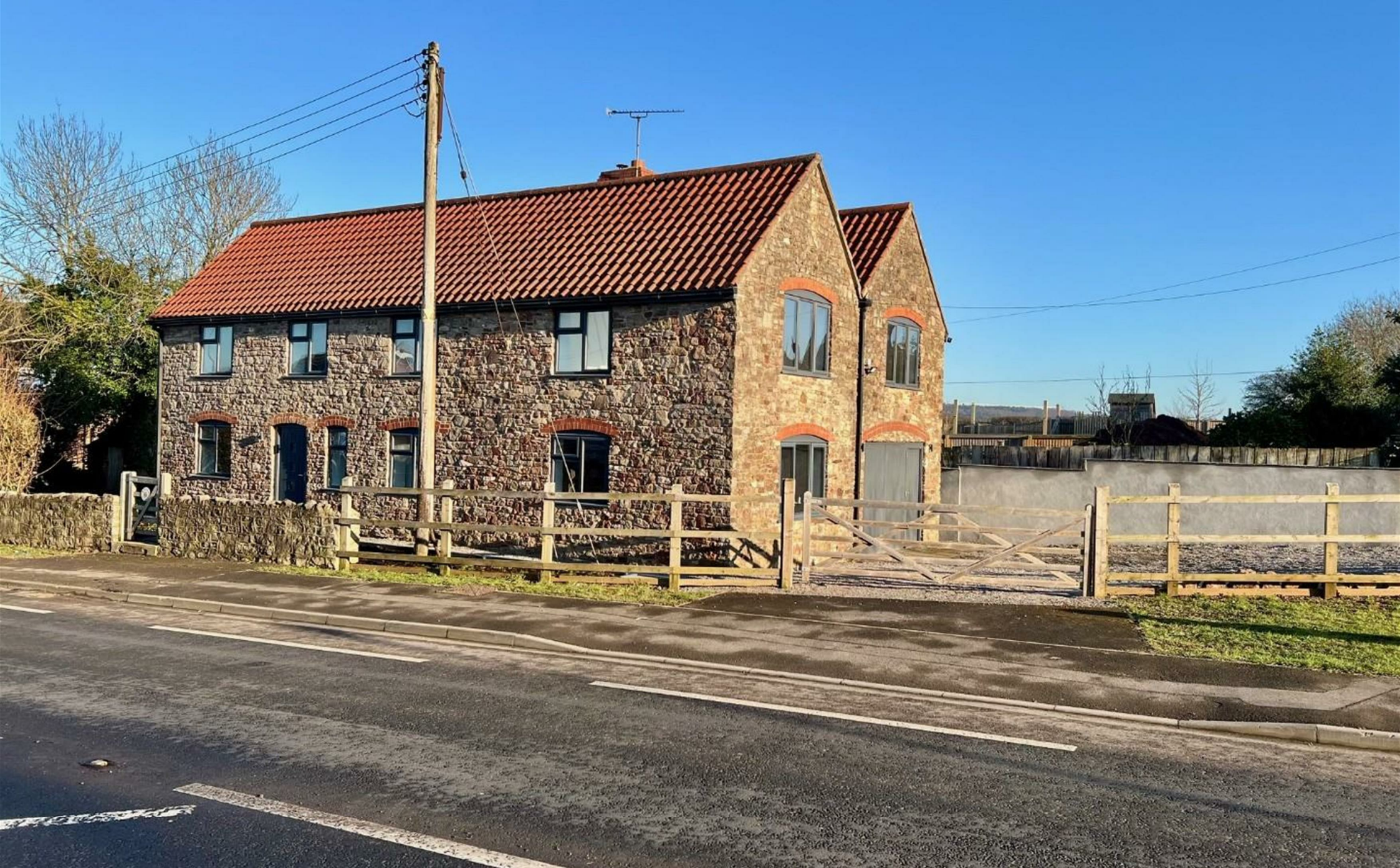
Park View Cottage, Stone, Berkeley GL13 9JY